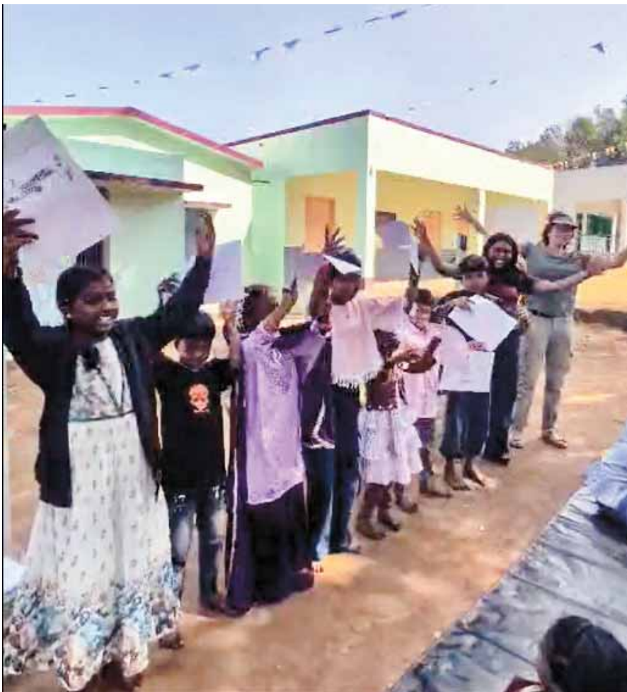
Below: Schoolchildren during a session at Project Padho Bharath .

the environment, a four-day Rotaract campaign distributed 7,000 cloth bags and two lakh paper bags across busy markets and retail malls.