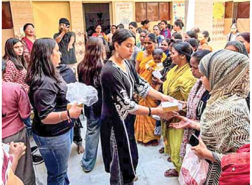
Women receiving sanitary napkins from the Rotaractors.

Separately, the club organised the fifth edition of its fundraiser, Bowl Out Cancer 5.0 , on April 23 and 24 at Fun City CP67,