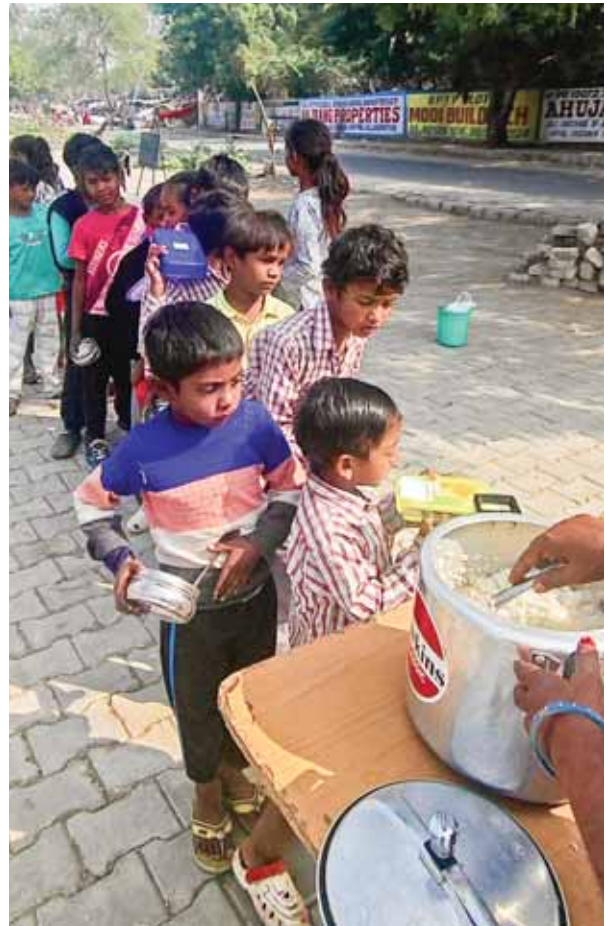
Food being distributed as part of Project Ahaar Daan .