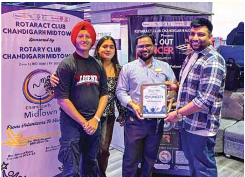
Rotaractors with the winner of the Bowl Out Cancer 5.0 competition.

a gaming mall. The event drew more than 200 participants and raised over ₹3 lakh for the treatment of two children with cancer.