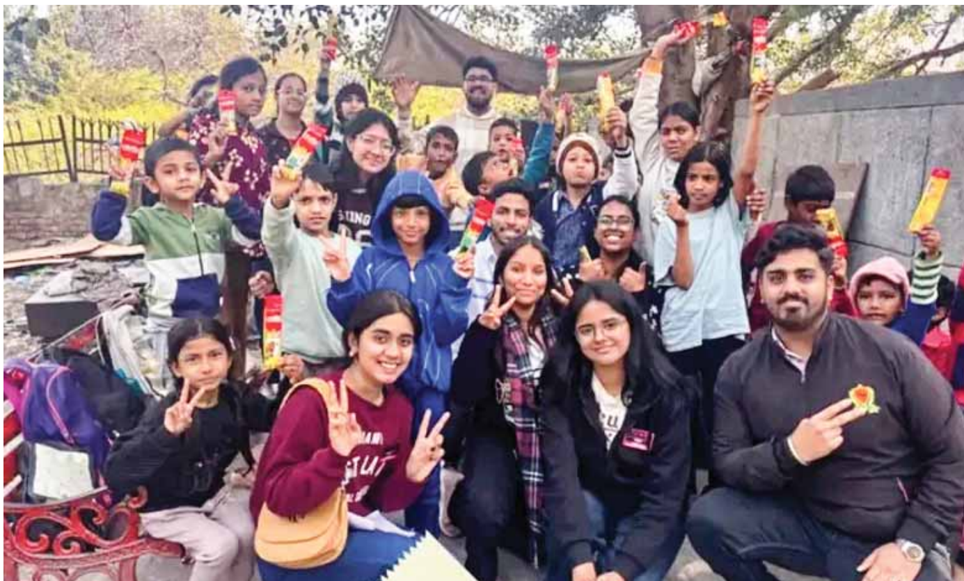
Rotaractors with children at one of the legal aid sessions in an impoverished locality in Delhi.