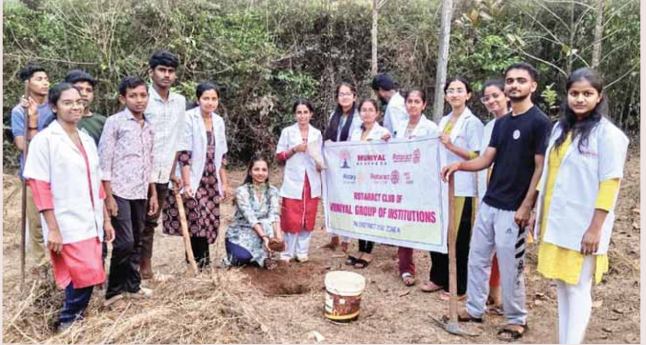
A sapling plantation drive.

Community outreach remains a monthly priority. Rotaractors frequently visit anganwadis and children’s homes to engage with young inmates. During a recent visit to an anganwadi in Patla, around 40 children participated in interactive sessions on health and hygiene. Through