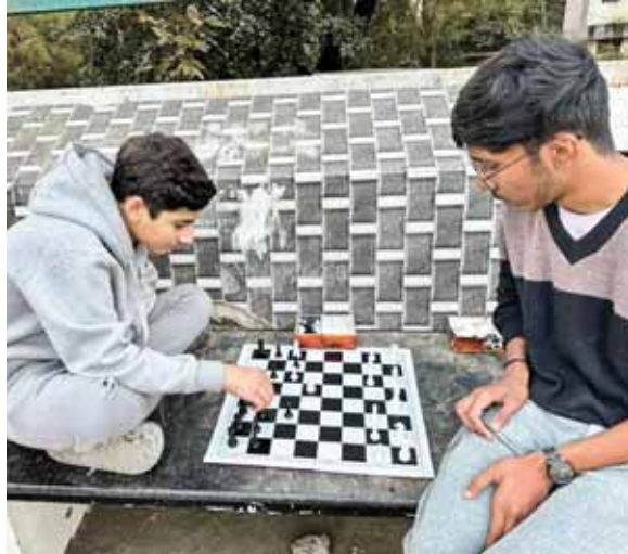
Left: A chess competition.