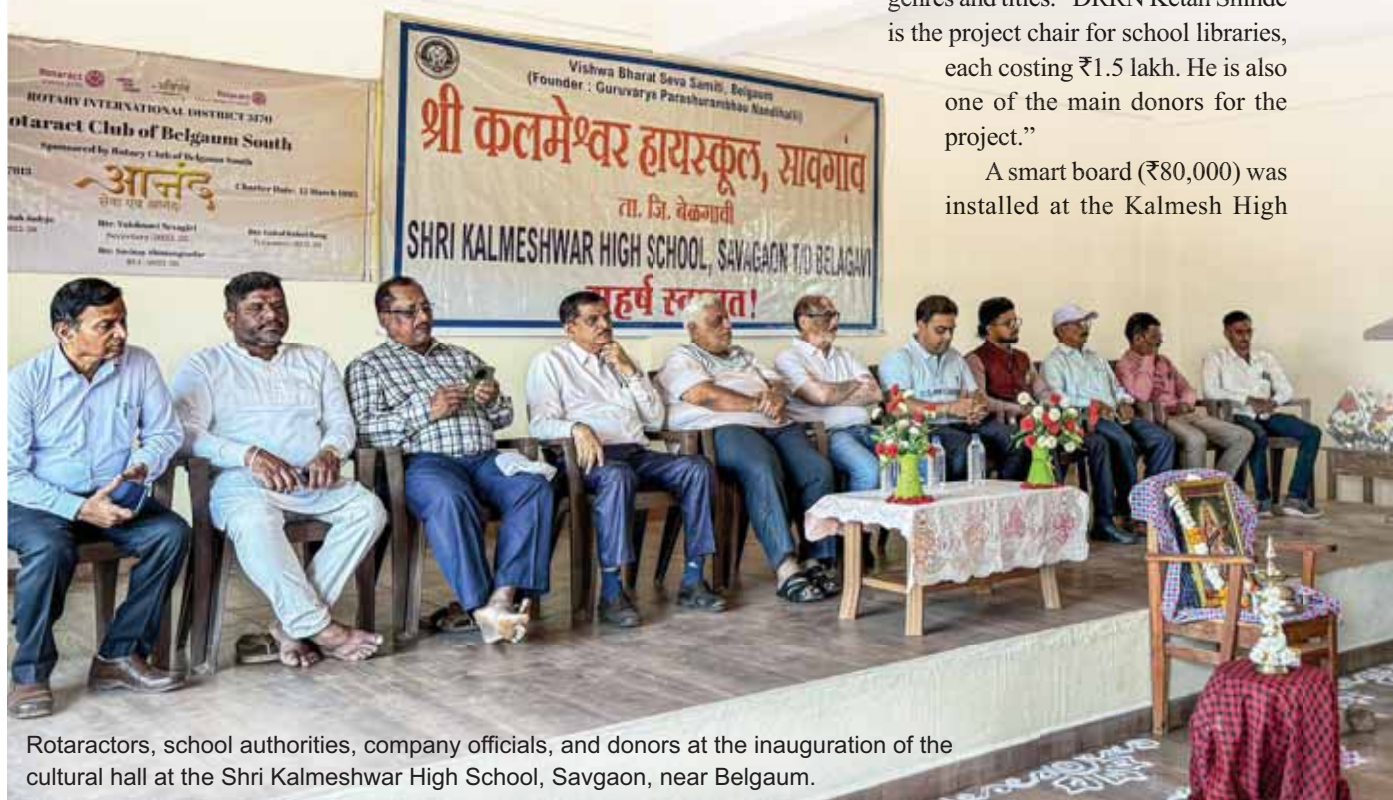
Rotaractors, school authorities, company officials, and donors at the inauguration of the cultural hall at the Shri Kalmeshwar High School, Savgaon, near Belgaum.

A smart board (₹80,000) was installed at the Kalmesh High