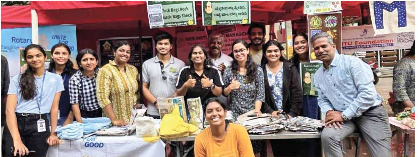
Left: Rotaractors arrange books for a government school library.