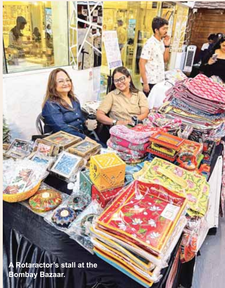
A Rotaractor's stall at the Bombay Bazaar.

“The response was overwhelming, with over