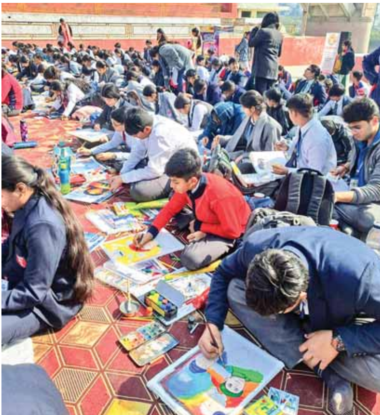
Participants at the Paint your imagination competition at the Shastri Ghat in Varanasi.