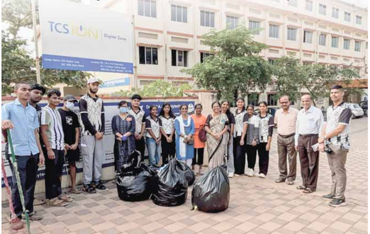
Rotaractors after carrying out the cleanliness drive at various locations in Manipal.