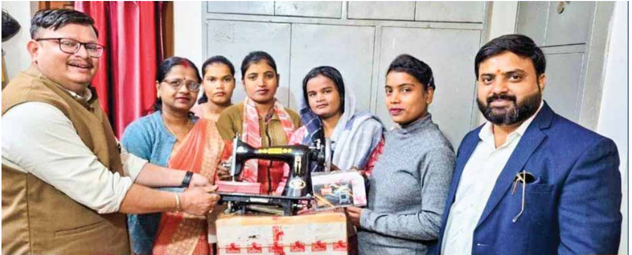
A sewing machine being presented to a woman as part of Project Shakti .

effort that has covered 30 schools so far.