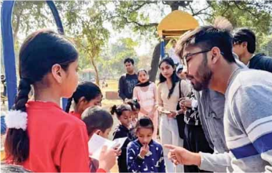
Above: A young girl being educated on her legal rights.