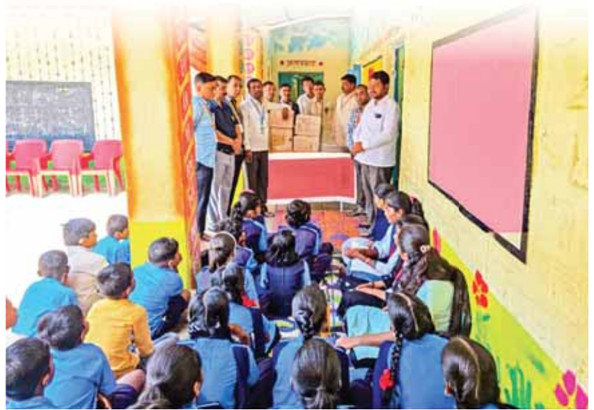
Rotaractors at a school distributing ready-to-make cereals to students.

the Rotary Club of Karad, which assisted with coordination and logistics during the campaign.