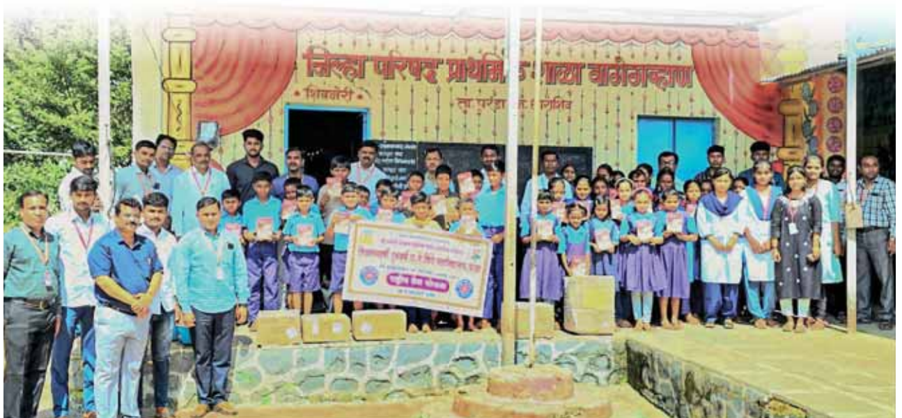
Government school students along with Rotary and Rotaract club members after receiving the nourishment kits.

two months. “Solapur district was the worst affected with 14 deaths. Over 1,500 houses and agricultural land were destroyed. Farmers were the worst affected by the floods and we wanted to make sure that help reached them.” ■