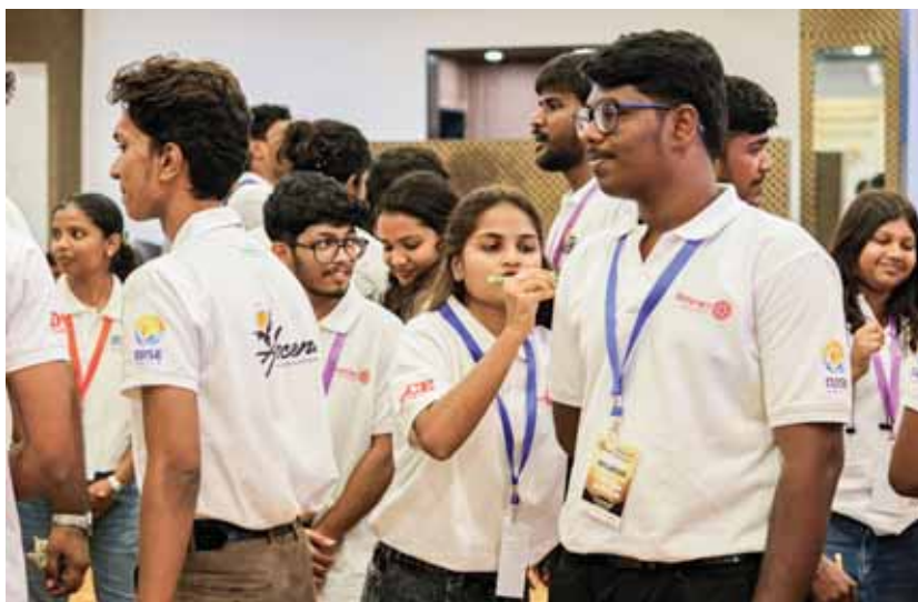
Rotaract participants at a RYLA.