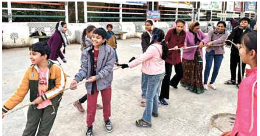
Below: Participants playing the tug of war game.