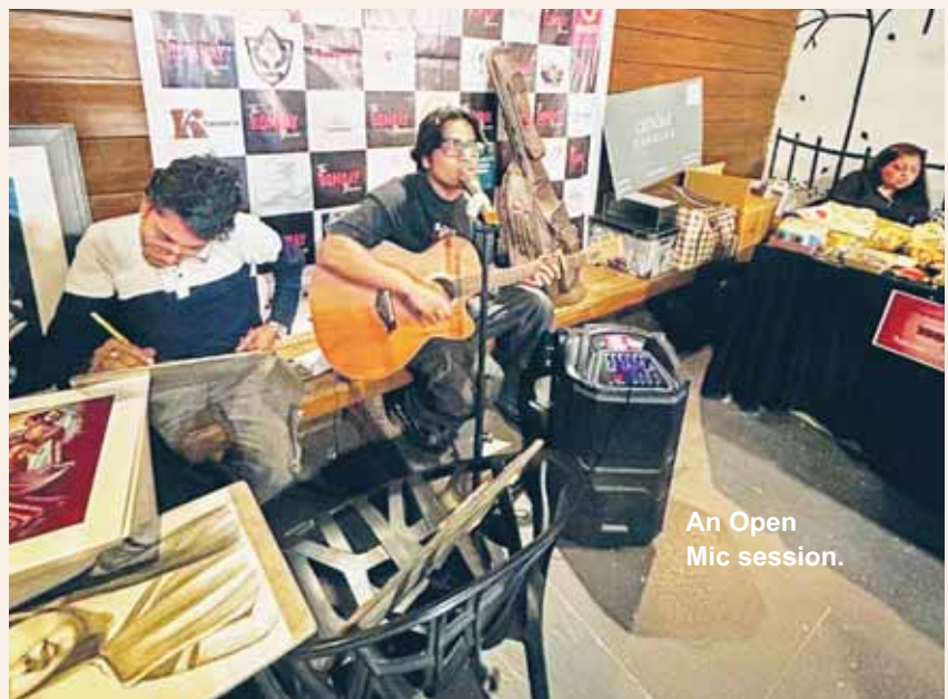
An Open Mic session.

young participants how to present their brand, interact with customers and understand the market. ■