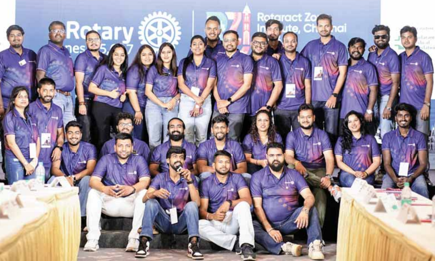
DRREs at the Rotaract Zone Institute held in Chennai.

A significant boost came from the Rotaract Club of Chennai Legends, an Annets-based club, which alone contributed over $60,000. “They executed their plan exceptionally well, with