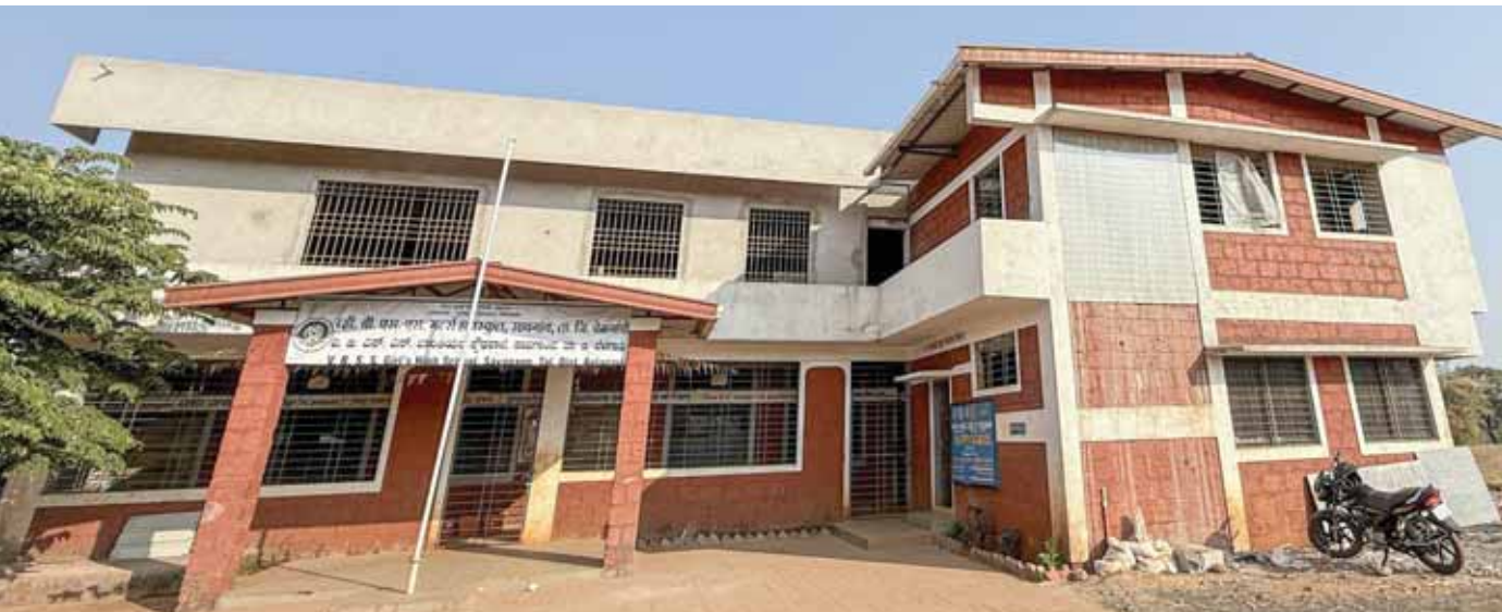
Shri Kalmeshwar High School in Savgaon near Belgaum.

School to provide a digital learning experience for students under Project Utsava . Under this project, “we pool in money on birthdays and personal anniversaries of our members, instead of a cake-cutting ceremony, to donate stationery items, books and install learning facilities at government schools,” says the IPP. Till now, school bags and stationery kits were distributed to 400 children at the primary section of 10 government and aided schools in Belgaum.