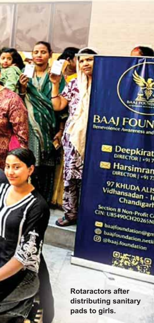
Rotaractors after distributing sanitary pads to girls.