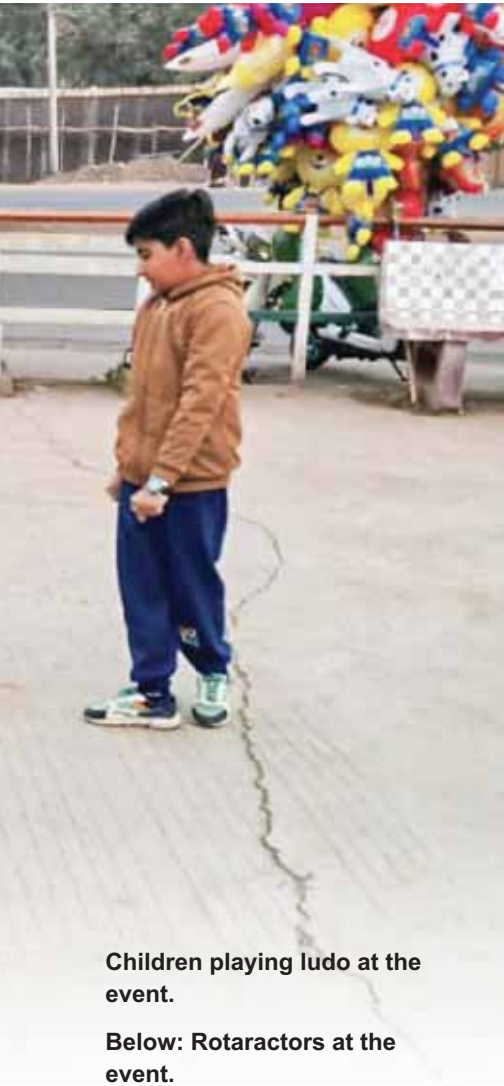
Children playing ludo at the event.