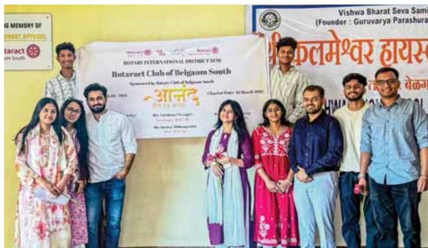
Rotaractors at the inauguration of the cultural hall.