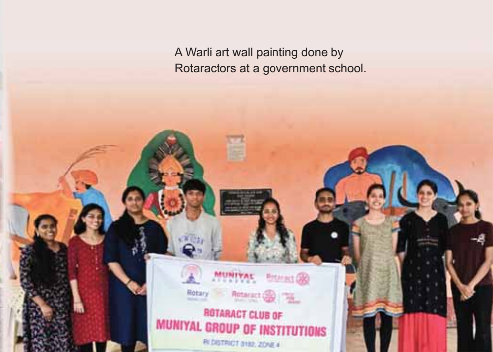
A Warli art wall painting done by Rotaractors at a government school.