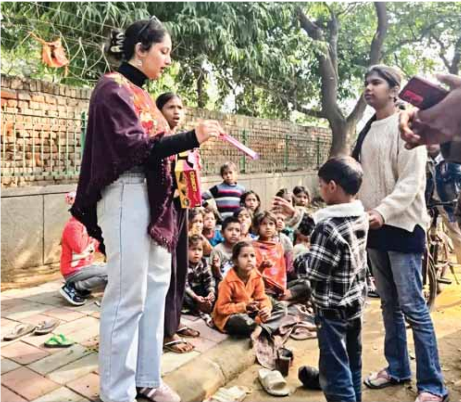
Below: Chocolates being distributed to children.